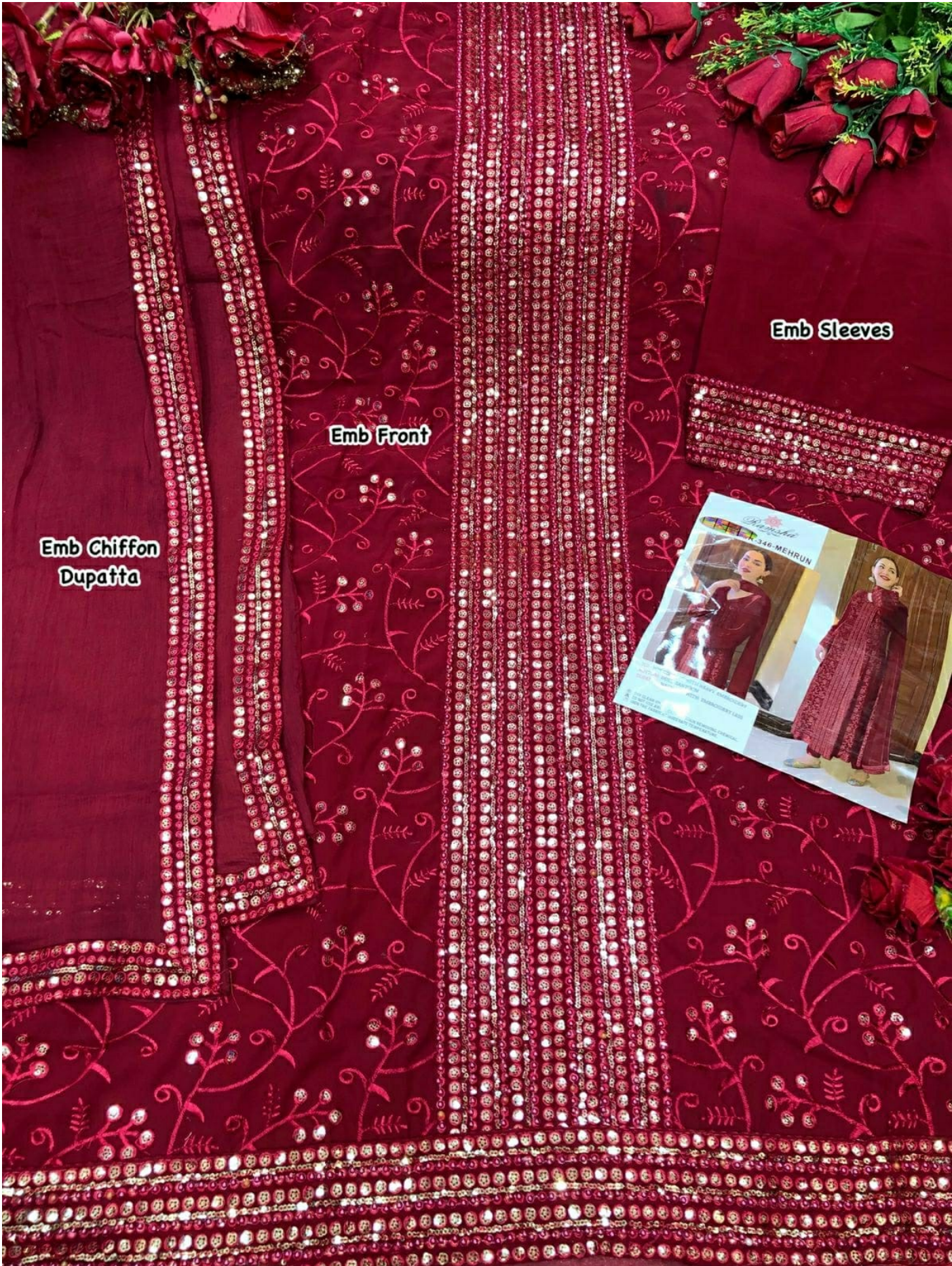
Emb Chiffon Dupatta