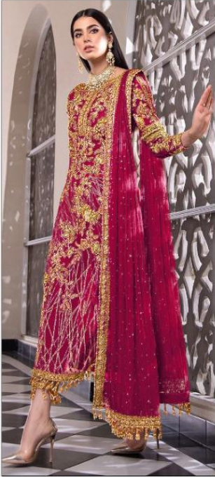
S- 64 A

Top - Butterfly net heavy embroidered with stone Inner Bottom - Heavy santoon with emb patch Dupatta - Butterfly net embroidered with pearls