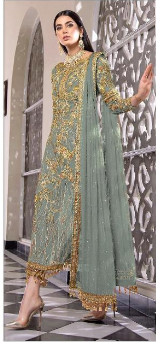
S- 64 G