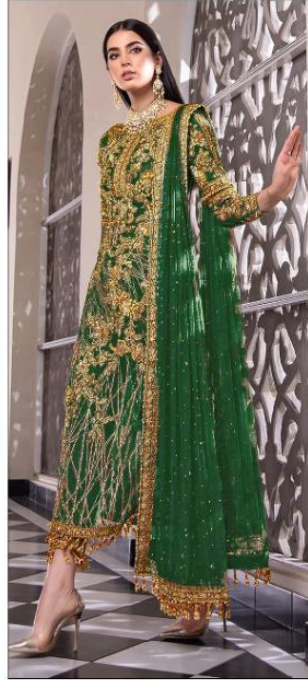
S- 64 C