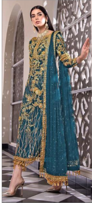
S- 64 B