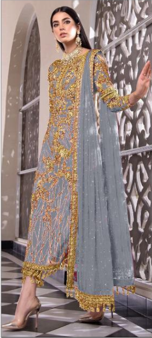
S- 64 E

Top - Butterfly net heavy embroidered with stone Inner Bottom - Heavy santoon with emb patch Dupatta - Butterfly net embroidered with pearls