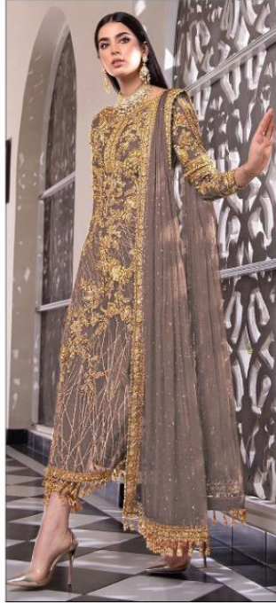
S- 64 F