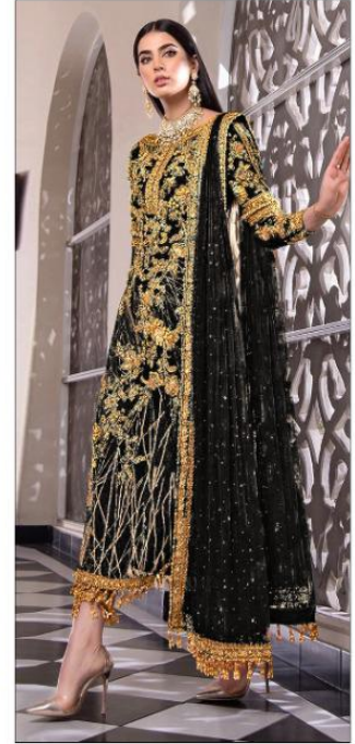
S- 64 D