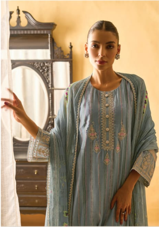
8777 SUMMER COLLECTION 2022