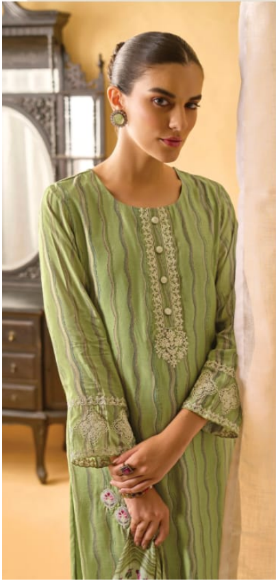
8 7 7 3 SUMMER COLLECTION 2022