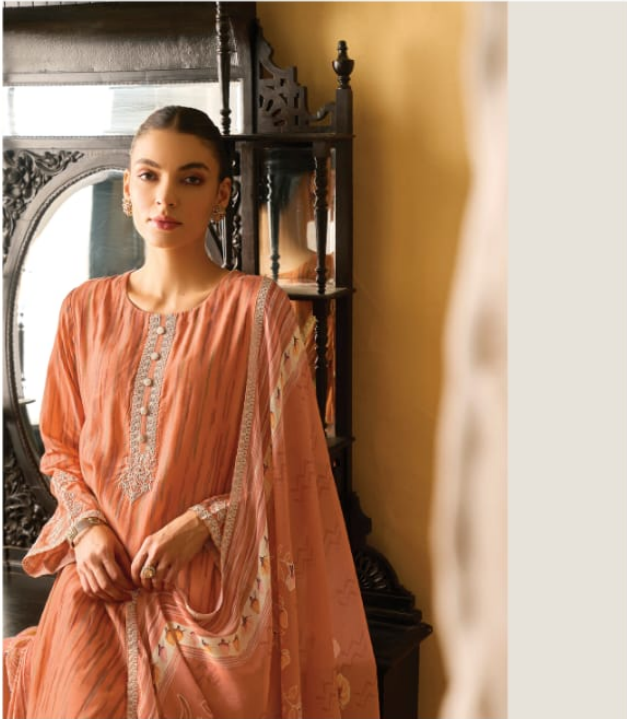
8772 SUMMER COLLECTION 2022