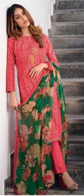
• SR/11 •