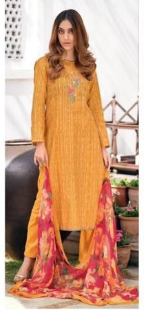
• SR/14 •