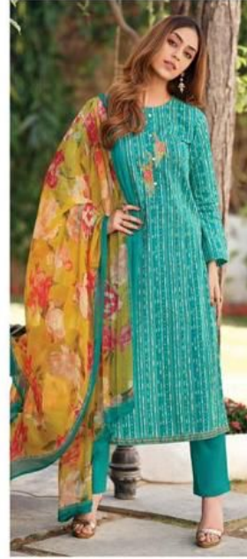
• SR/13 •