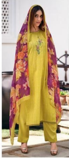
• SR/12 •