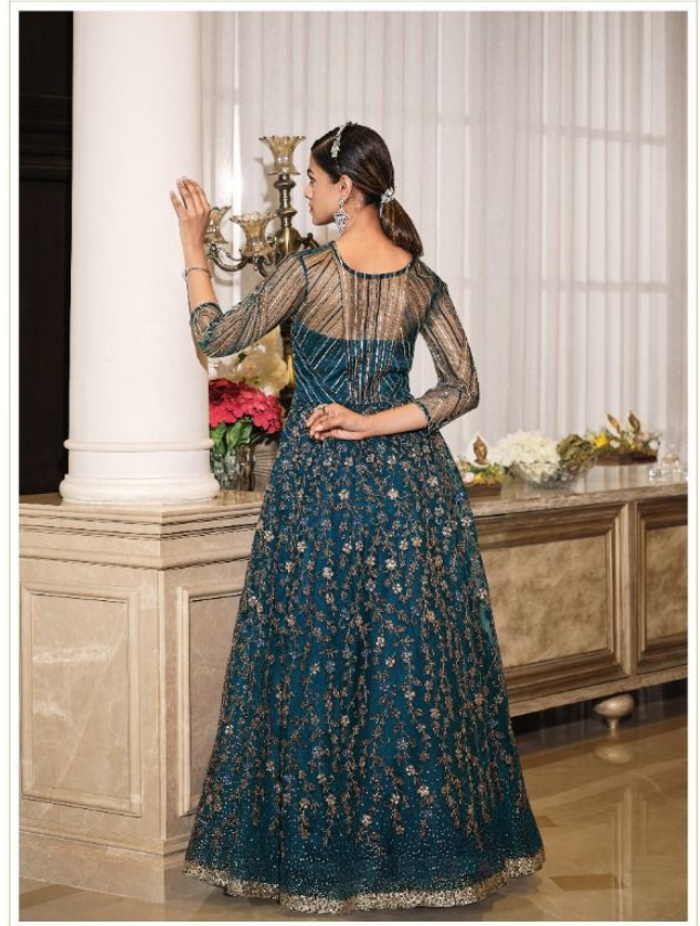
A MODERN TOUCH | 4832