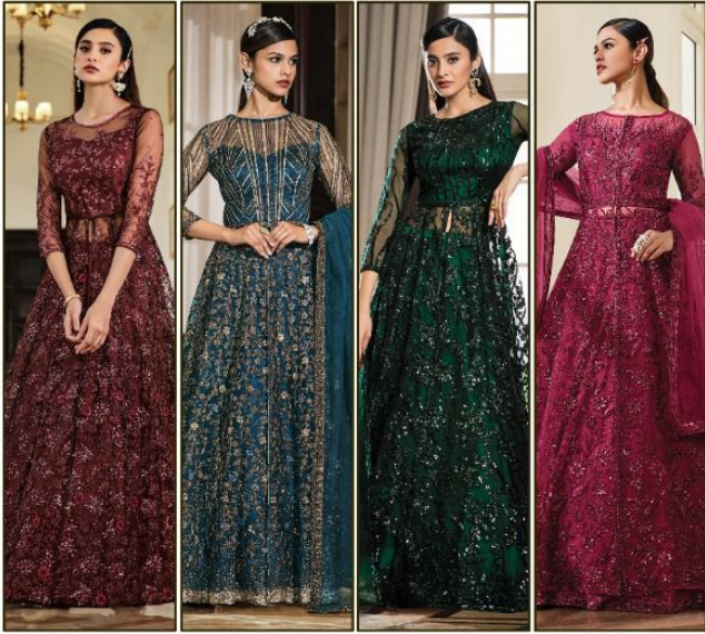
◆ 4831 ◆