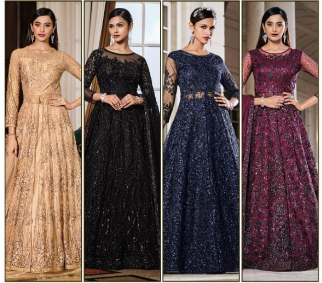
◆ 4835 ◆