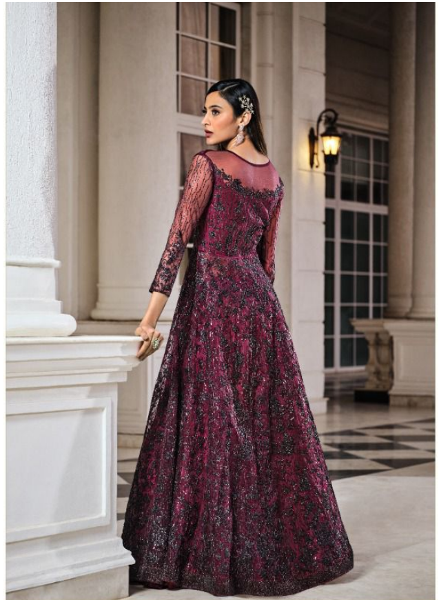
A MODERN TOUCH 4938