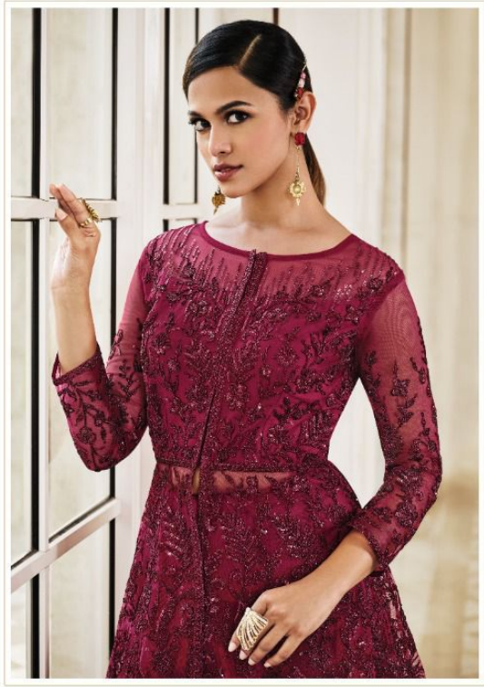
A MODERN TOUCH 4834