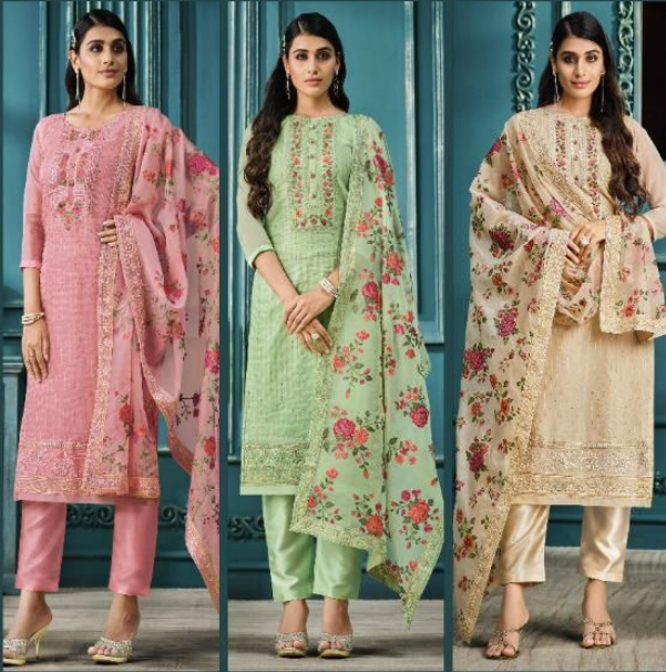
— 4811 —