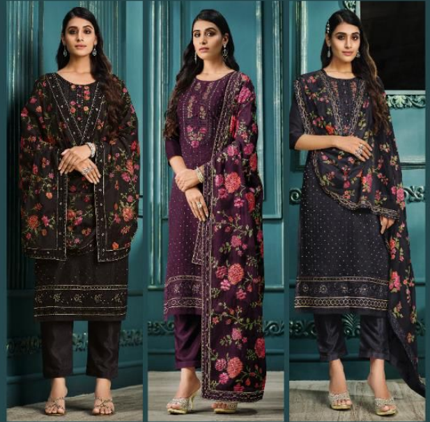
— 4814 —