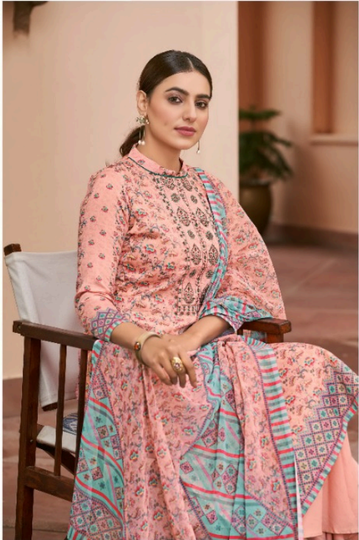
DESIGN - I-732 001 THE KEY IS TO CONTRAST. AND THERE'S SO YOU DON'T END UP OVER DOING THE FEMININE QUOTIENT