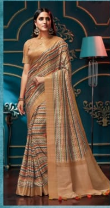
DESIGN / 8101