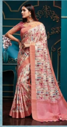
DESIGN / 8108