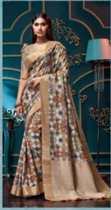
DESIGN / 8102