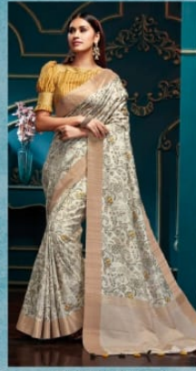
DESIGN / 8107