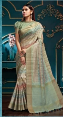
DESIGN / 8104