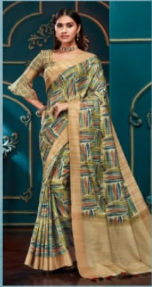
DESIGN / 8106