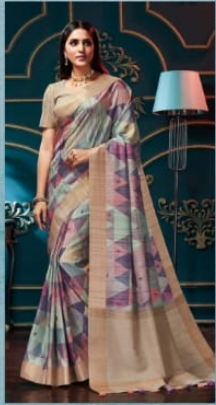
DESIGN / 8105