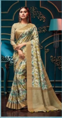
DESIGN / 8103