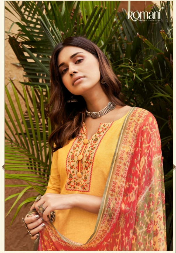
Mirai Bright colors in one of the strongest fabric collection of the season and best design plus feature a more different and artistic effect. 1018-007