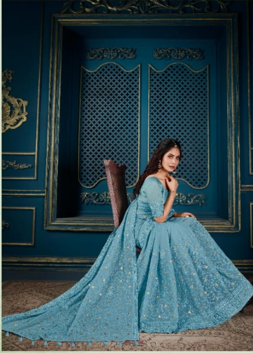
05 We're feeling beauty this winter with amazing design and pleasing colours promise to get us in the mood. In a single bound