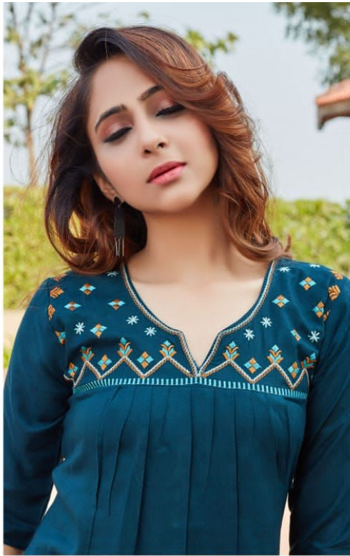
CREAM OF THE CROP