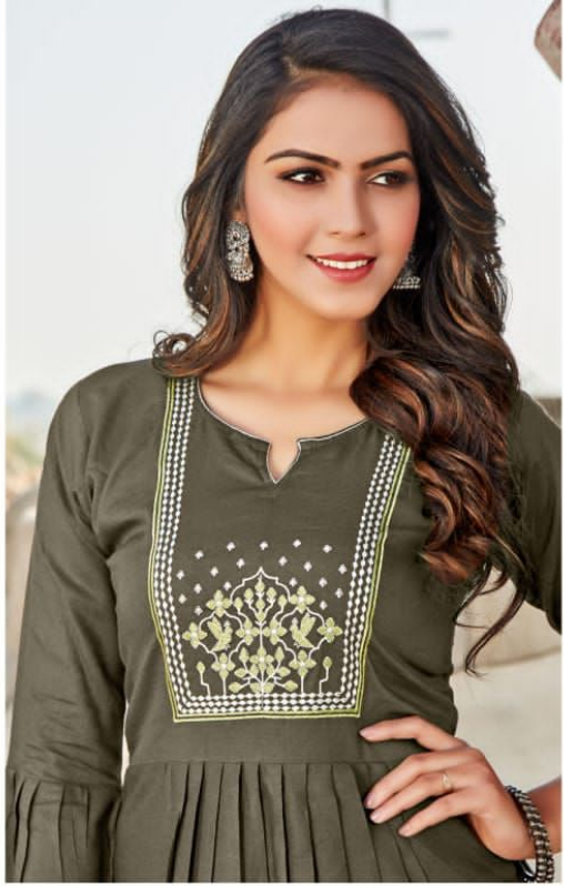
CREAM OF THE CROP