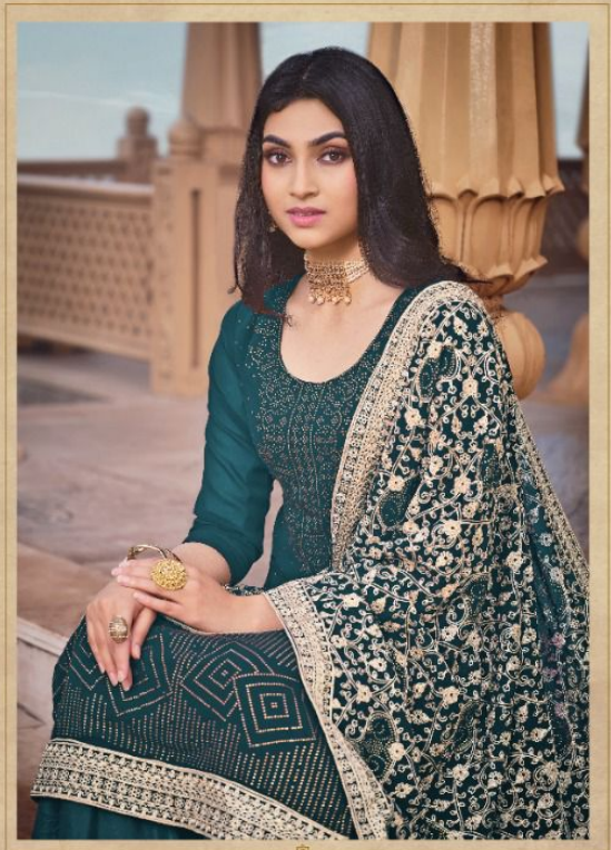
with it's vibrant shades, bold colors, the new season on the Indian runway is the perfect mix of modern and ethnic. all you have to do is wear your favorite.