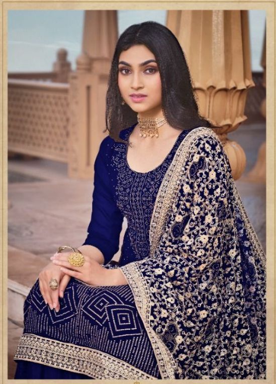
Get yourself this six yard of pure abhinav work which will take you to Heaven and our deep rooted culture with a modern twist. 6003