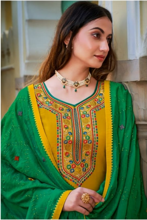
GLAM — 3352 — DIVA