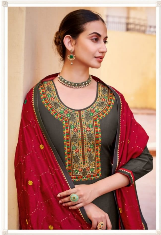
FREE — 3353 — SPIRIT