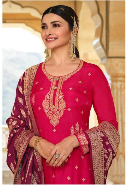
The royal "Finely interwoven threads and spectacular colour combination: Truly Royal."