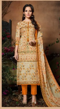
D. NO. 63003