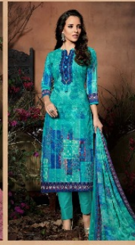
D. NO. 63005