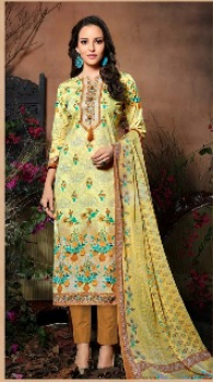
D. NO. 63008