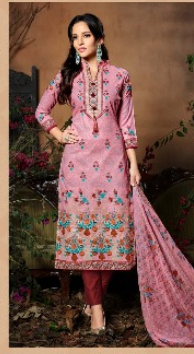
D. NO. 63004