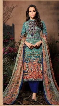
D. NO. 63010