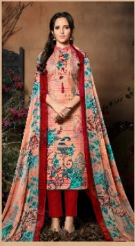
D. NO. 63001