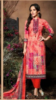
D. NO. 63011