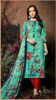
D. NO. 63007