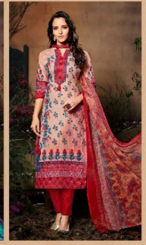
D. NO. 63006