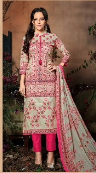
D. NO. 63009