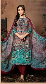
D. NO. 63002