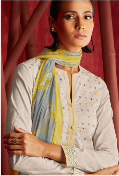
TASNIM | 10 ❦