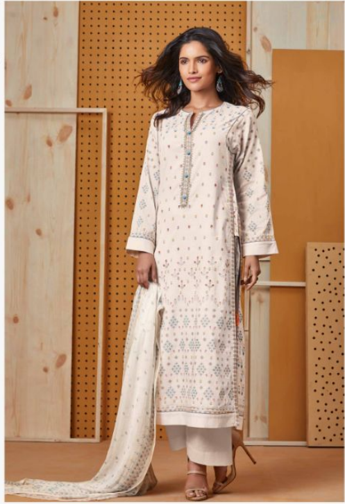
TASNIM | 01