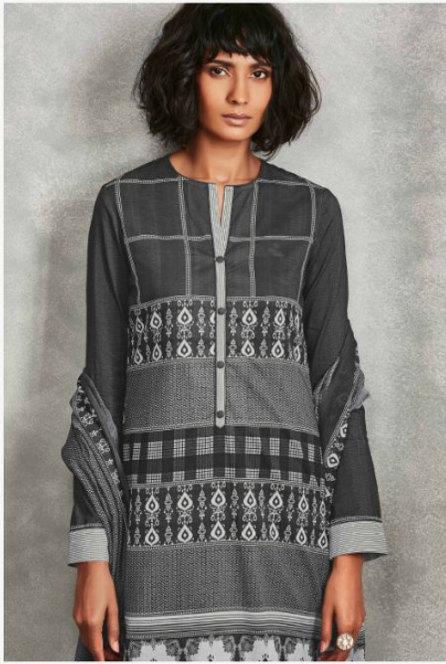
TASNIM | 04