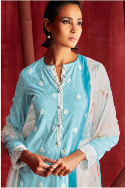
TASNIM | 06 ❦