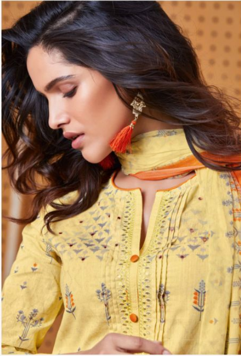
TASNIM | 08 ❦