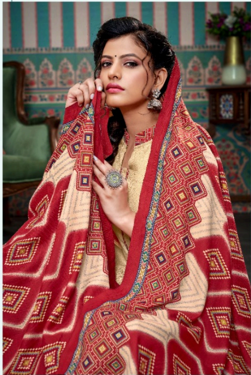
Fashion is not something that exist in dress only, fashion is in the way, in the street, fashion has to do with ideas the way we live, what is happening