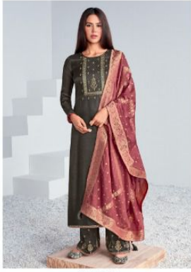
| 8620 |