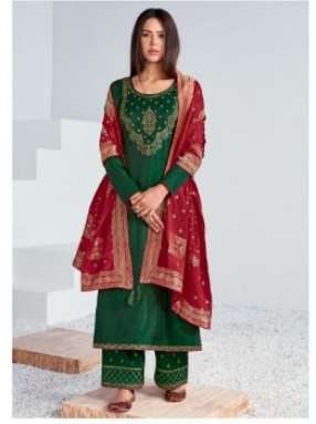
| 8625 |