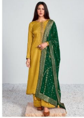
| 8623 |