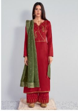
| 8622 |