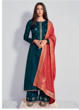
| 8621 |