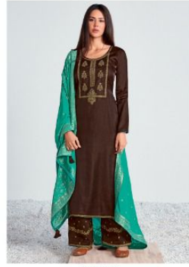
| 8624 |