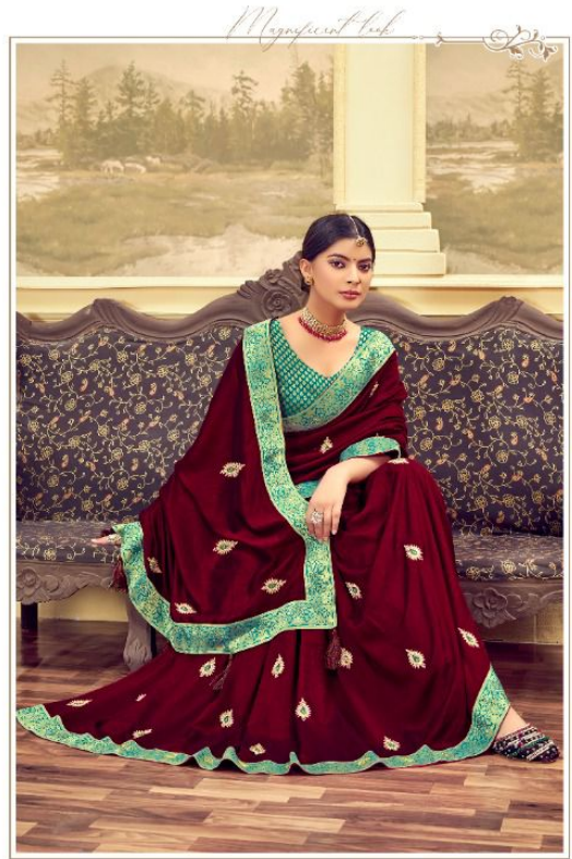
BLOOMING WINE VICHITRA SILK SAREE WITH EMBROIDERED BUTTIES AND SWAROVSKI HAVING BROCADE BORDER WITH SWAROVSKI WORK AND TUSSELD PAIRER WITH KAMA BROCADE BLOUSE