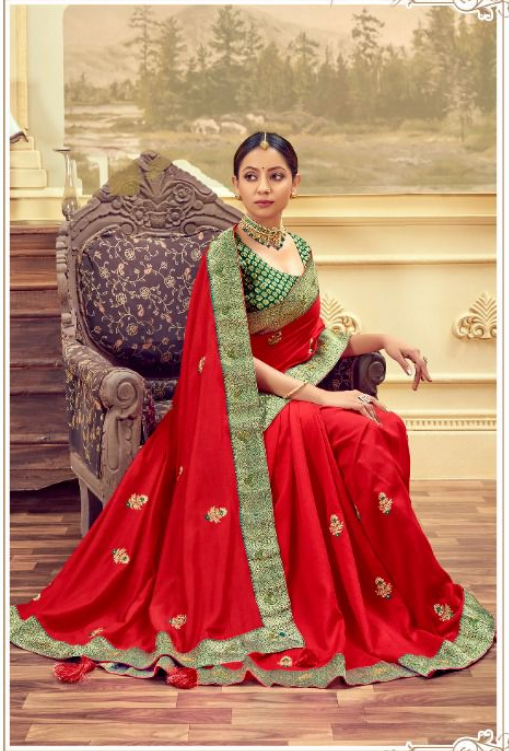
BLOOMING RED VICINTRA SILK SAREE WITH EMBROIDERED BUTTIES AND SWAROVSKI, HAVING BROCADE BORDER WITH SWAROVSKI WORK AND TUSSELS, PAIRED WITH GREEN BROCADE BLOUSE