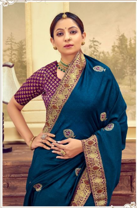
BLOOMING BLUE VICHITRA SILK SAREE WITH EMBROIDERED BUTTIES AND SWAROVSKI, RAYING BROCADE BORDER WITH SWAROVSKI WORK AND TUSSELS, PAIRED WITH SHINE BROCADE BLOUSE