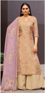
D NO. : 16005