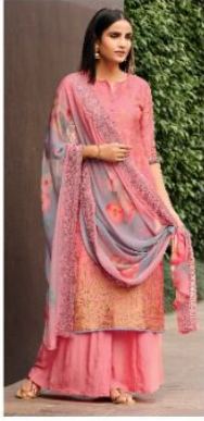
D NO. : 16003