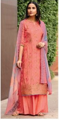
D NO. : 16001