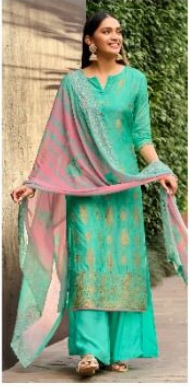
D NO. : 16002