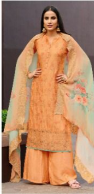
D NO. : 16006