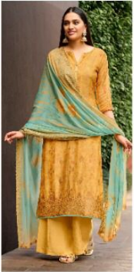
D NO. : 16004