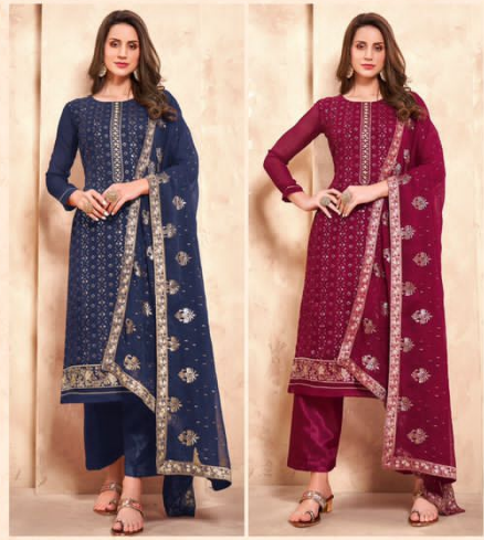
* 2022-D *