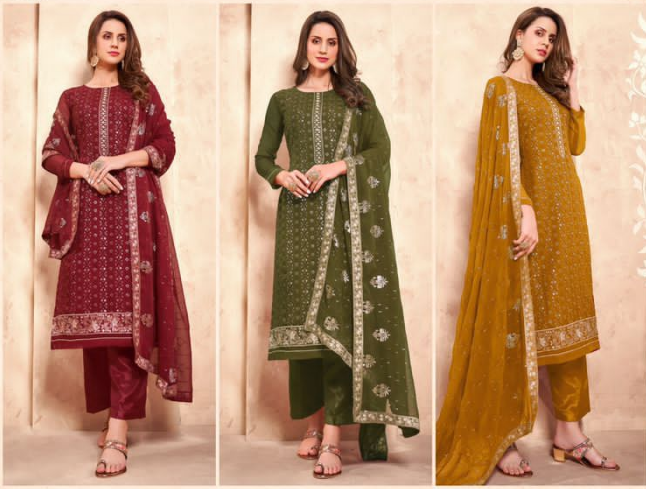
* 2022-A *