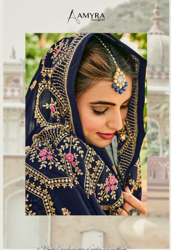
A beautiful amalgamation of colors and motifs