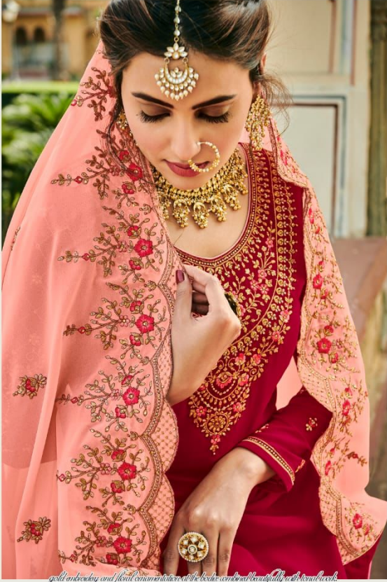
gold embroidery and floral ornamentation of the look combined beautifully with floral work.