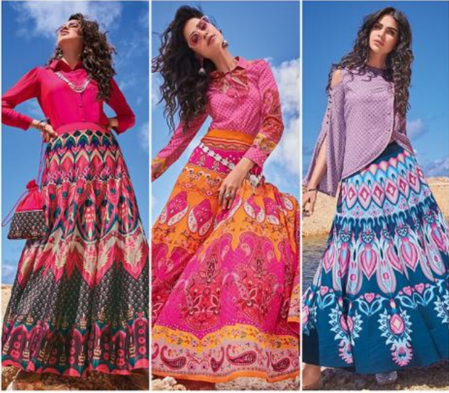
• 201 •