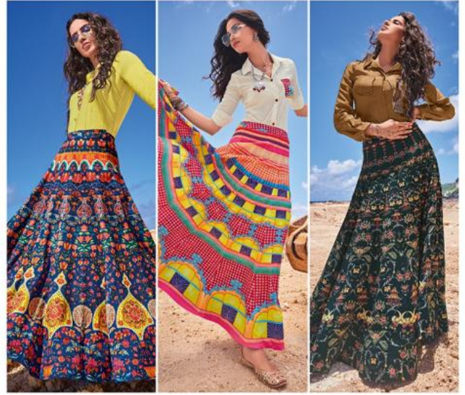
• 204 •