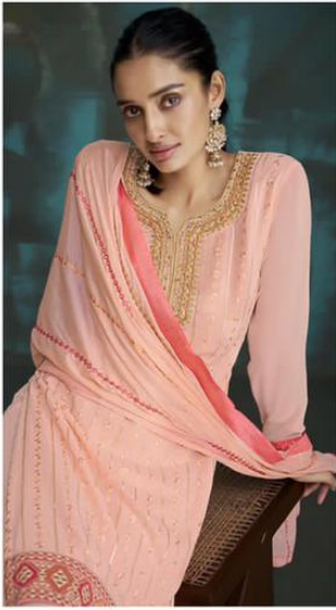
112 | Attractive embroidery work with beautiful contrast color makes the suit more attractive.