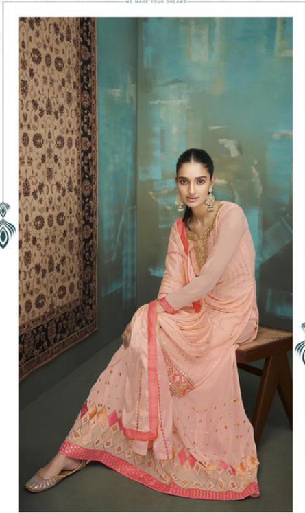
112 | Attractive embroidery work with beautiful contrast color makes the suit more attractive.