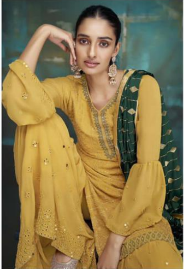
113 | Mustard color dress and contrast green scarf, embroidery work from above enhances her adornment.