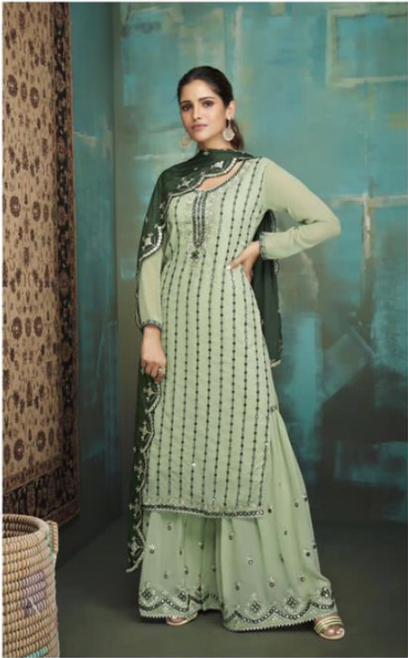
111 These impeccable shades of cool hold a prestige only revealed on closer inspection buy now - wear forever!