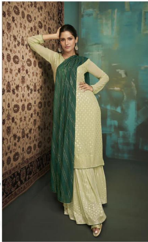
114 Beautiful color with great design sequence work that makes everyone look at you.