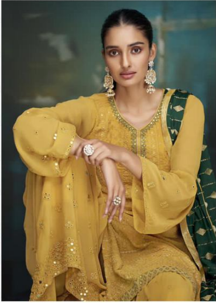
113 | Mustard color dress and contrast green scarf, embroidery work from above enhances her adornment.