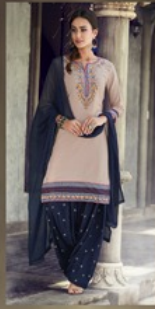
D NO. : 598