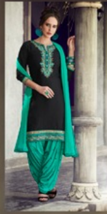
D NO. : 597