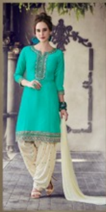
D NO. : 595