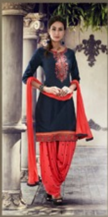
D NO. : 596