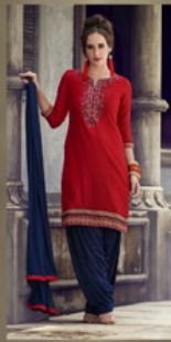
D NO. : 601