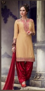
D NO. : 591