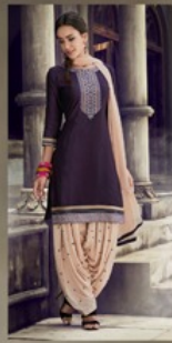
D NO. : 600