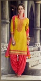
D NO. : 599