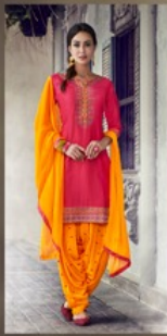
D NO. : 594