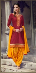
D NO. : 592