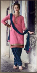
D NO. : 593