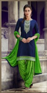
D NO. : 602