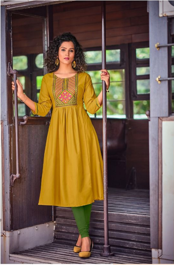
Culture club 'Welcome to the new age of style in Indian Saree Where an unmatched prints designs and beautiful. Feelings of fabrics