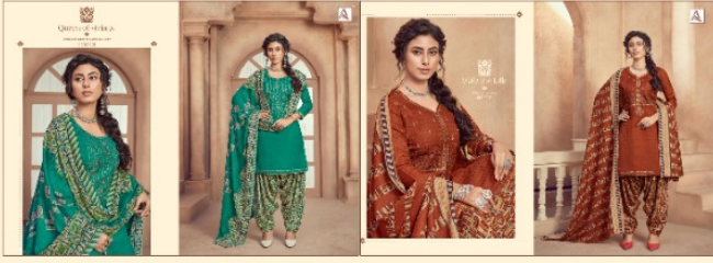
I 682 001