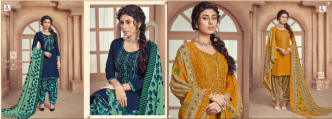
I 682 003