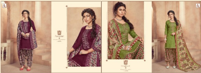
I 682 005