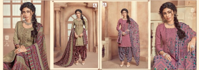
I 682 009