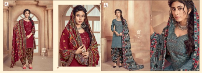
I 682 007