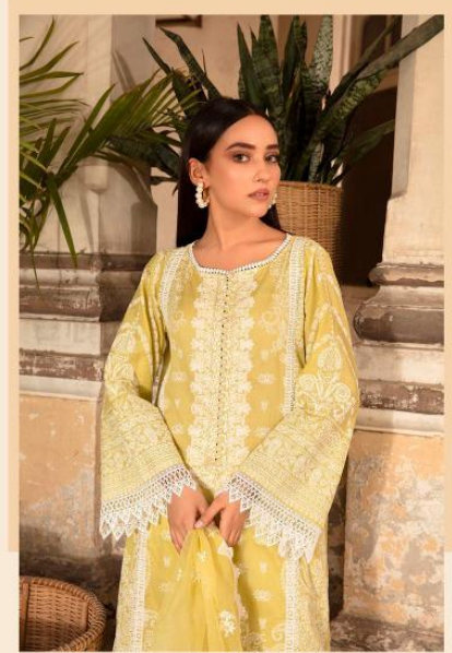
DESIGN | 1146