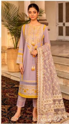
DESIGN | 1141