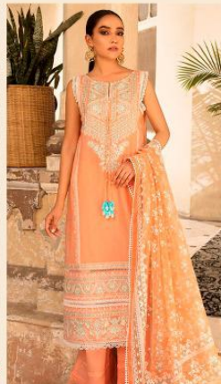
DESIGN | 1144