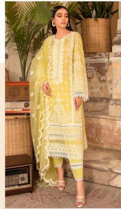
DESIGN | 1146