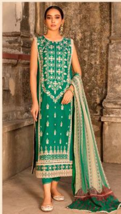
DESIGN | 1143