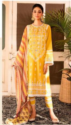
DESIGN | 1142