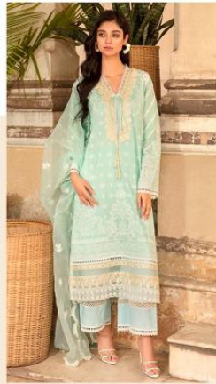
DESIGN | 1145