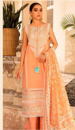
DESIGN | 1144