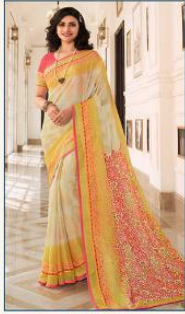
❁ 23732 ❁