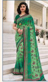
❁ 23737 ❁