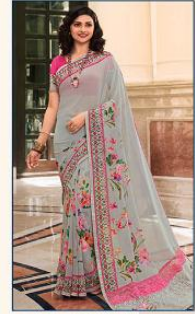
❁ 23739 ❁