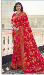
❁ 23733 ❁