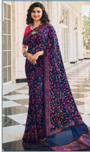
❁ 23735 ❁