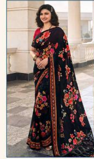
❁ 23738 ❁