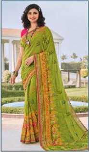
❁ 23734 ❁