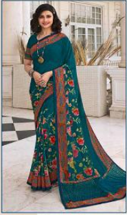
❁ 23731 ❁