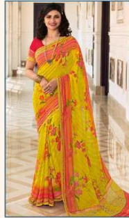
❁ 23736 ❁