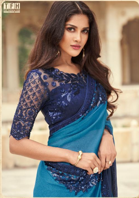
Georgette saree with floral embroidery blouse. Fabric: 100% silk and sequins and SW-818