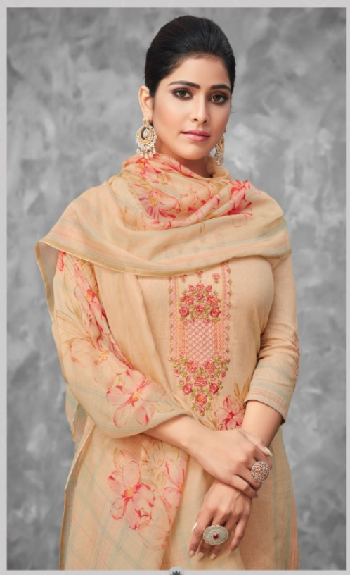
TOP : COTTON SATIN BOTTOM : CAMBRIC DYED DUPATTA : MUSLIN JARI BORDER RIYA - 101