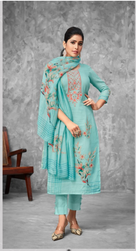
TOP : COTTON SATIN BOTTOM : CAMBRIC DYED DUPATTA : MUSLIN JARI BORDER RIYA - 106