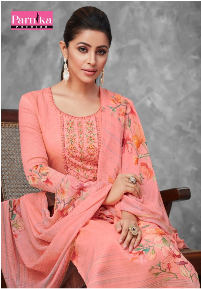
RIYA - 102 TOP : COTTON SATIN - BOTTOM : CAMBRIC DYED DUPATA : MUSLIN JARI BORDER