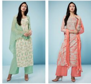
D.NO - 6126