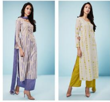
D.NO - 6124