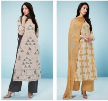
D.NO - 6122