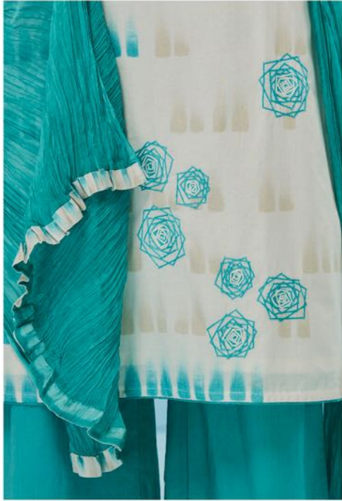
A CLASSIC NEVER GOES OUT OF STYLE. D.NO :- 6120