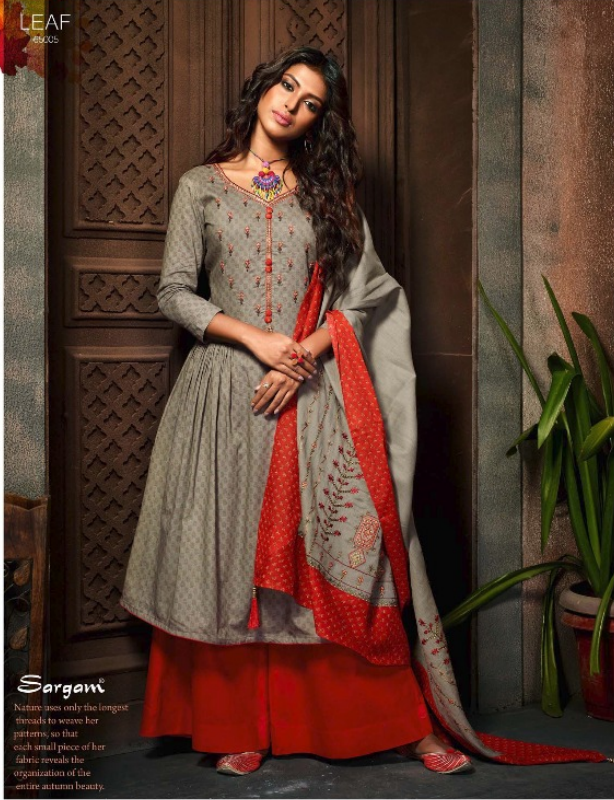
Sargani Nature uses only the longest threads to weave her patterns, so that each small piece of her fabric reveals the organization of the entire autumn beauty.