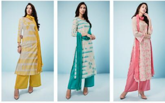
D.NO - 6119