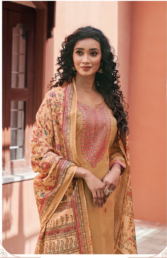
Flaunt the pretty colors and exquisite designs coupled with quality and freshness.