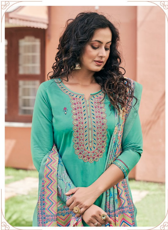
Embracing your traditional wear with a hint of contemporary styling this range is truly desirable.