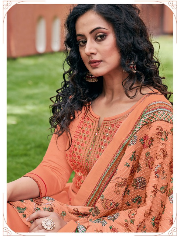
The collection marks gorgeous designs and a touch of grace and tradition.