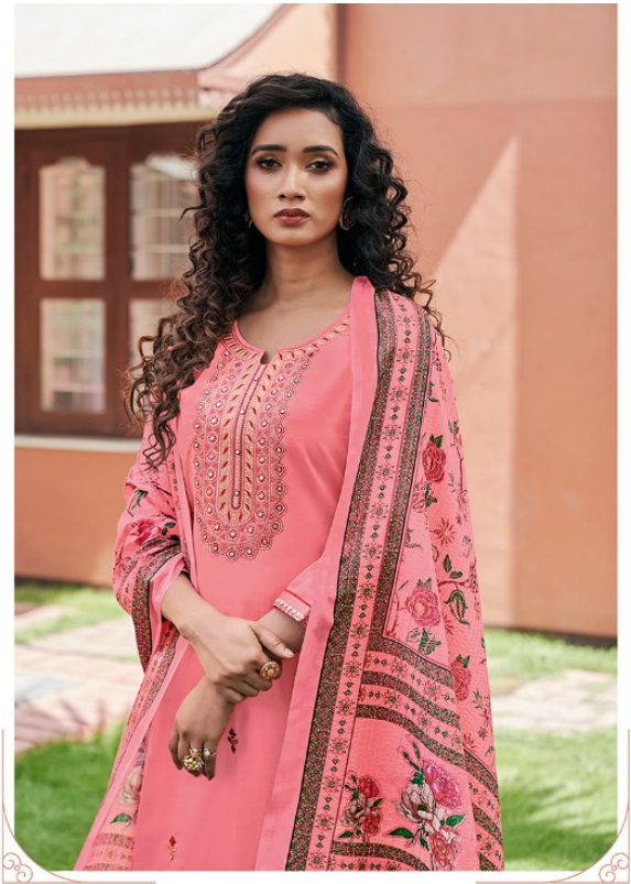
Channel your creative spirit with ultra luxe fabrics and get your hands on new ethnics, this season.