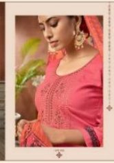
I 693 004