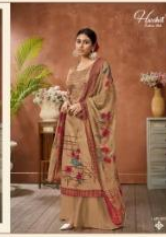
I 693 003