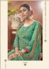
I 693 010