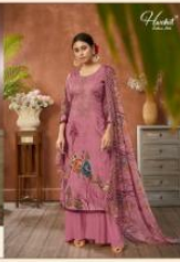
I 693 002