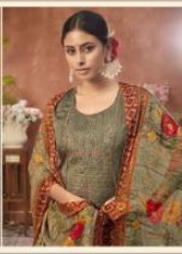
I 693 008