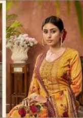
I 693 006