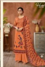
I 693 009