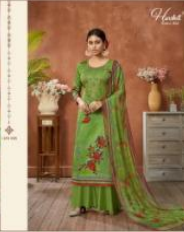
I 693 005