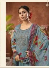
I 693 007