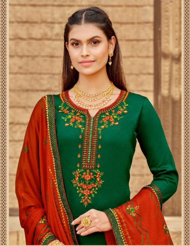
In a gist, an exhaustive range of collection that brings back subtlety in style!