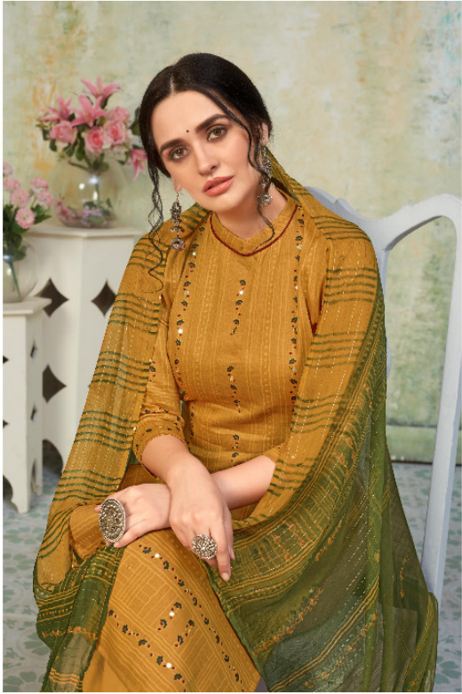
Embroidery and thread work which has added a real charm to women clothed in this collection. | 698 005