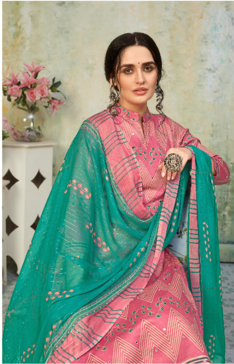
Design brings flashy patterns on filmy fabric simplest style into something worthwhile.