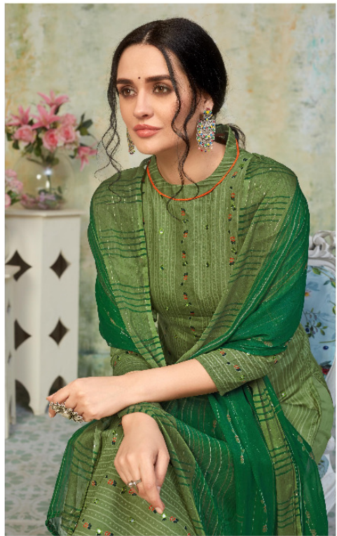
Explore the mystic beauty of patel in cool season shade. I 698 003