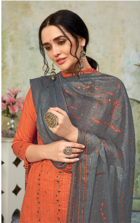
Experience the exotic floral bliss in soft hues and embroidered floral design. | 698 008