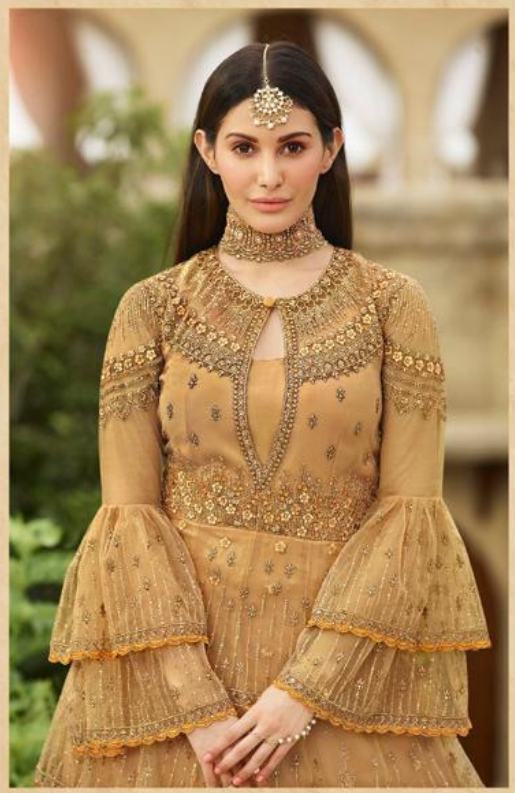
Royal ✨ vibrancy