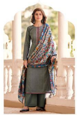
❁ 2007 ❁