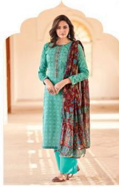
❁ 2004 ❁