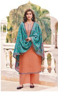
❁ 2002 ❁