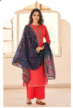
❁ 2005 ❁