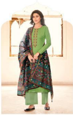
❁ 2003 ❁