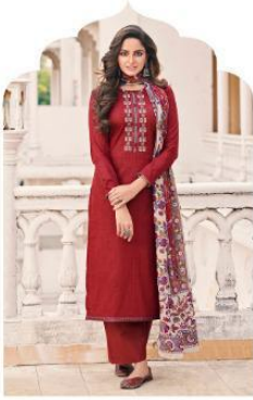
❁ 2000 ❁