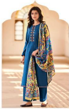
❁ 2001 ❁