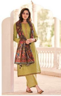
❁ 2006 ❁