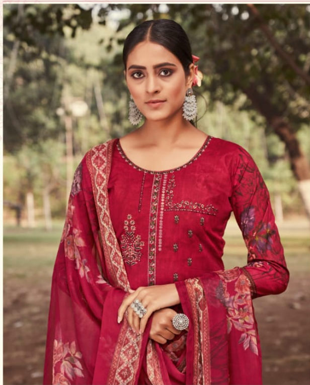
Designed to give you the style with a variety of floral work and patch work printed design