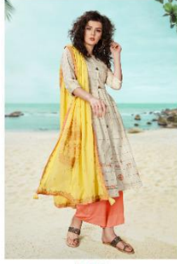
| 1852 |