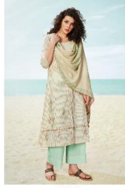
| 1853 |