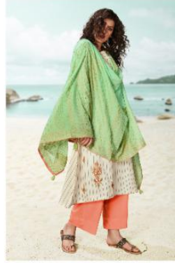
| 1856 |