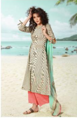
| 1854 |