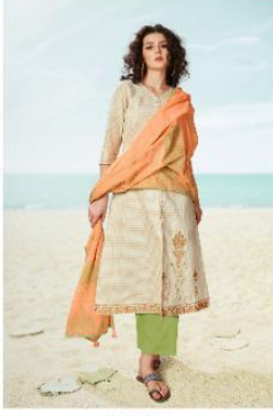
| 1851 |