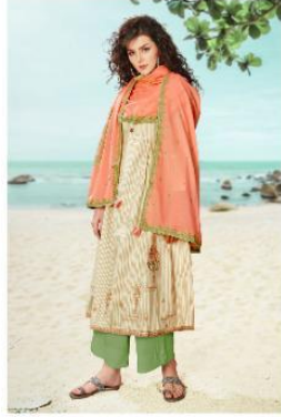
| 1855 |