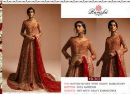
Ramsha TOP- BUTTER FLY NET WITH HEAVY EMBROIDERY BOTTOM- GULL SASTOON DUPATTA- NET WITH HEAVY EMBROIDERY