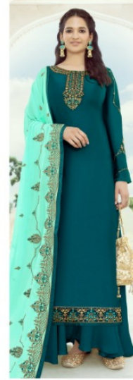
D.NO : S0005