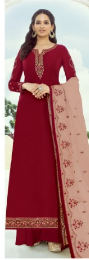
D.NO : S0004