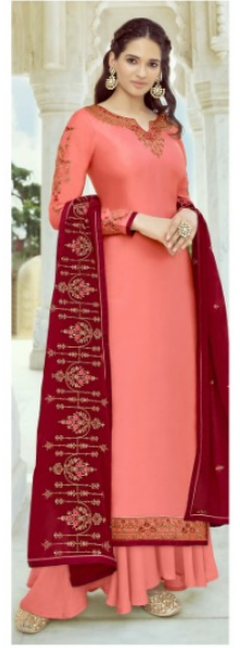
D.NO : S0006