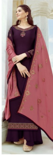
D.NO : S0003