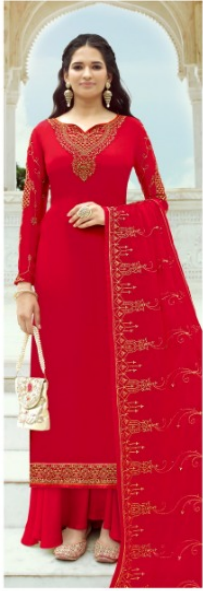
D.NO : S0001