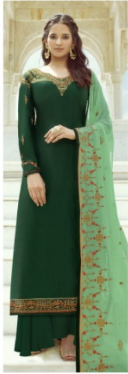
D.NO : S0002