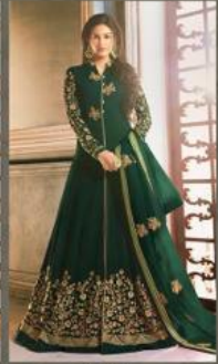
D. No. 9058