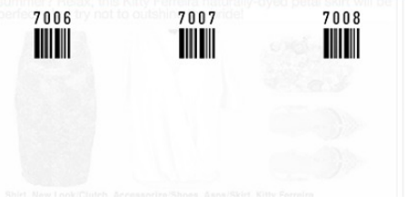
Short: New York / Faith; Accessories: Shona; Shoes: Sissi; Kitty Fenners

Visit www.harpercollins.co.uk/HCBAME or #HCBAME for application details