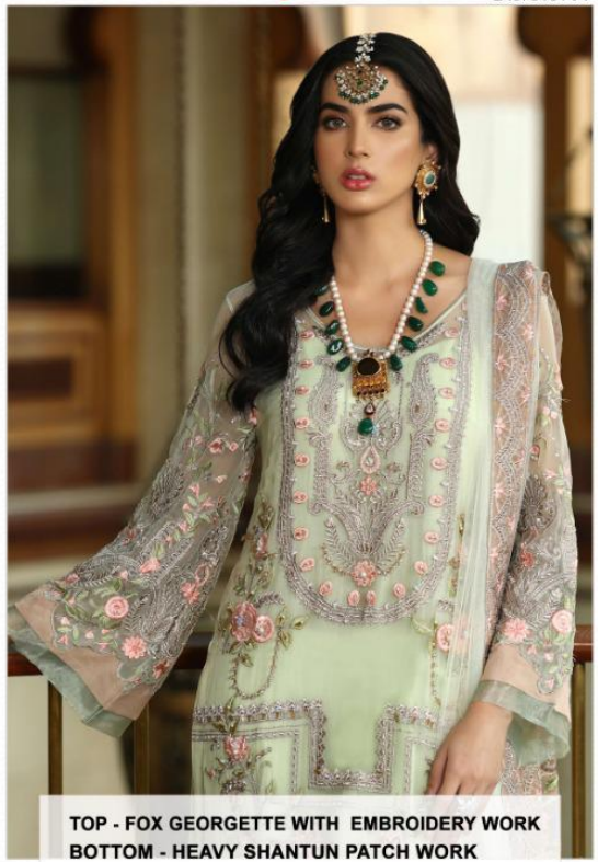
TOP - FOX GEORGETTE WITH EMBROIDERY WORK BOTTOM - HEAVY SHANTUN PATCH WORK INNER- HEAVY SHANTUN DUPATTA - NET WITH HEAVY EMBROIDERY WORK

Serena Pakistani Wear A BRAND BY MEGHA EXPORT D.NO.1704