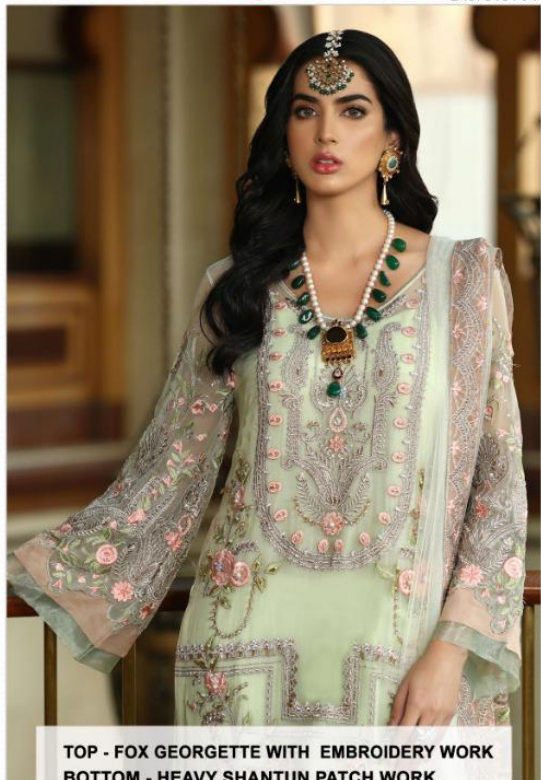
TOP - FOX GEORGETTE WITH EMBROIDERY WORK BOTTOM - HEAVY SHANTUN PATCH WORK INNER- HEAVY SHANTUN DUPATTA - NET WITH HEAVY EMBROIDERY WORK

Serena Pakistani Wear A BRAND BY MEGHA EXPORT D.NO.1704