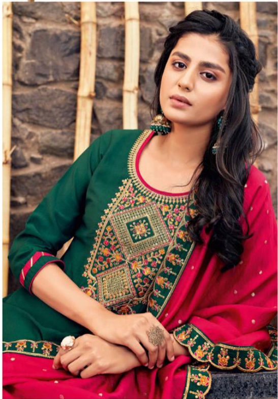
0222 #FRESH FASHION This season look up with some truly inspiring & elegantly