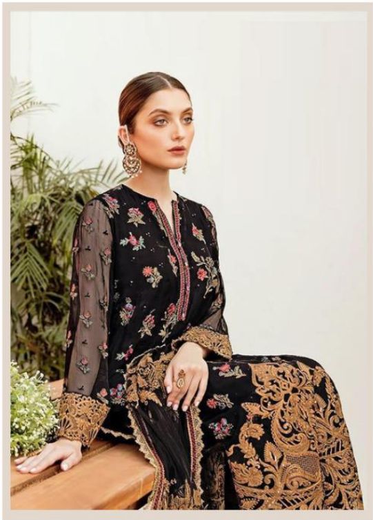
Top - Georgette heavy embroidered Inner Bottom - Santoon silk Dupatta - Butterfly net heavy embroidered