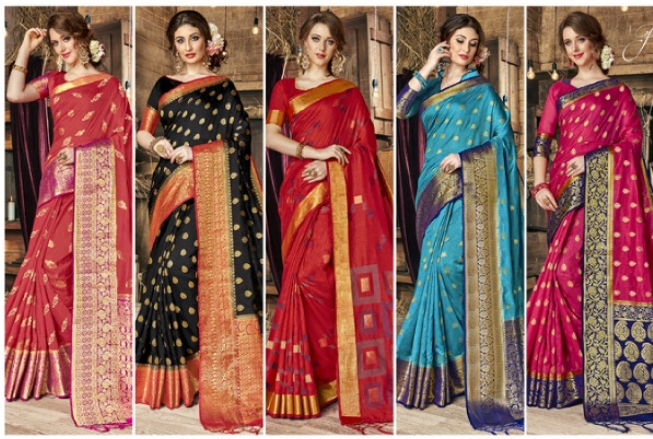
N-117 N-118 N-119 N-120 N-121