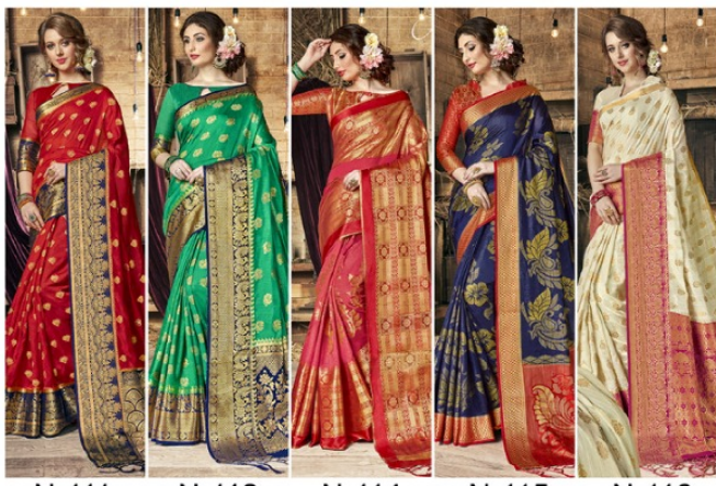
N-111 N-112 N-114 N-115 N-116