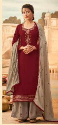
D NO :- 1053