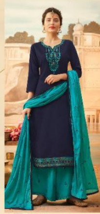
D NO :- 1054