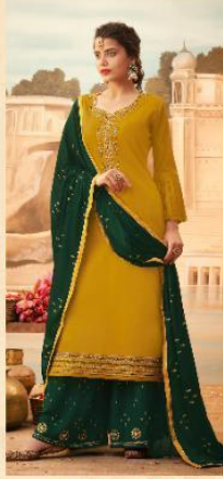
D NO :- 1052