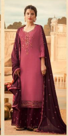
D NO :- 1056