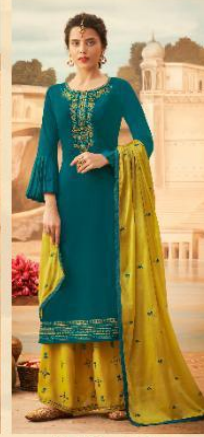
D NO :- 1055