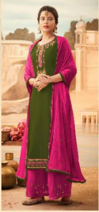
D NO :- 1051