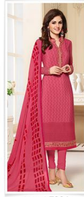
STYLE NO. 7904