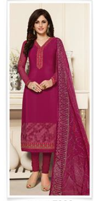
STYLE NO. 7906