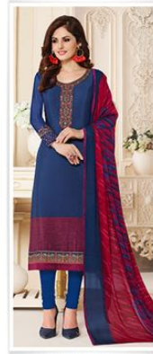
STYLE NO. 7910