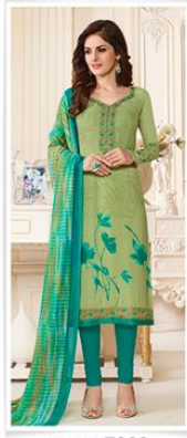
STYLE NO. 7903