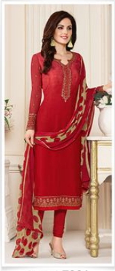
STYLE NO. 7901