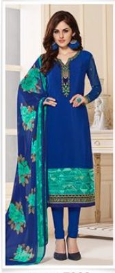
STYLE NO. 7902