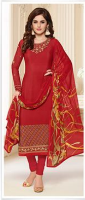
STYLE NO. 7908