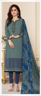
STYLE NO. 7907