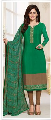
STYLE NO. 7909