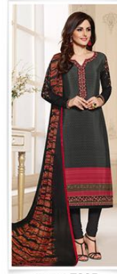
STYLE NO. 7905